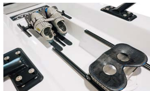
Adjustable carbon seats & Active tools shoes