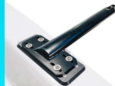
Fixed anodized half riggers